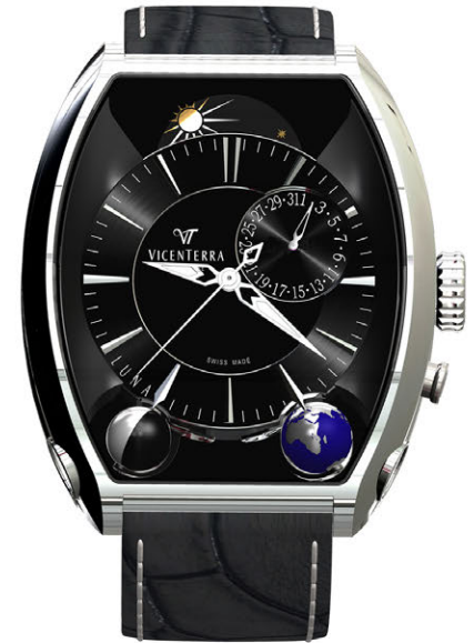
Volume 3 black