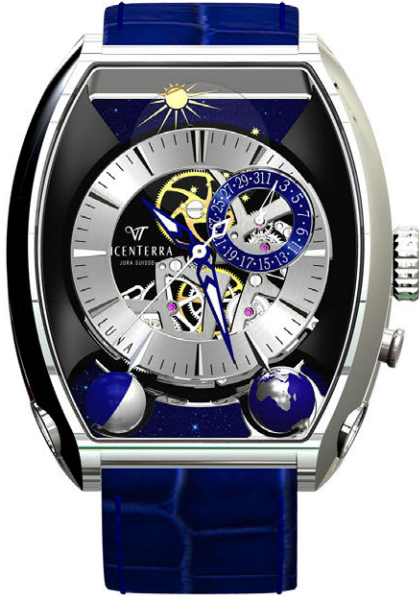
Volume 2 Open dial

During BASELWORLD 2015, VICENTERRA will launch a new subscription for the following timepieces :