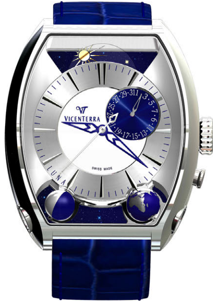
Volume 3 white