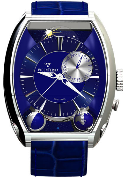
Volume 3 blue